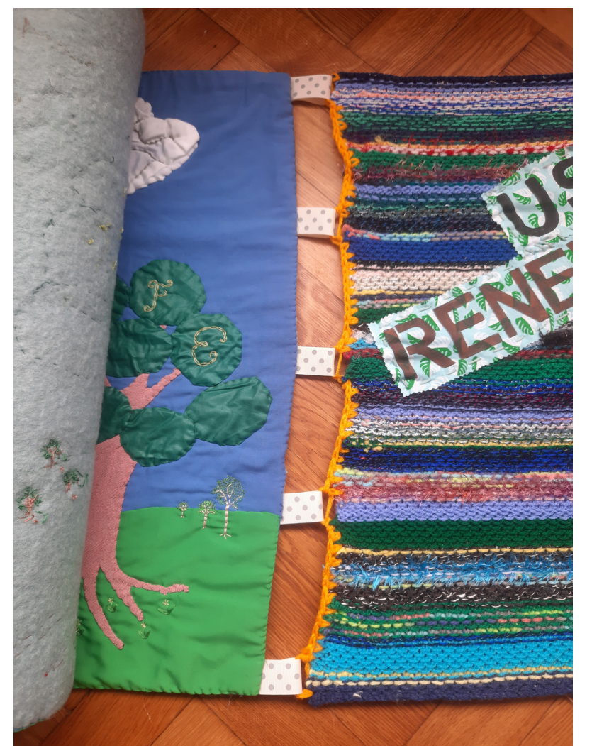
Fabric Loops (3) with crochet (2)

6 - Crochet method. Use method 3 (fabric loops) or 4 (continuous ribbon) and then crochet together using method 2.