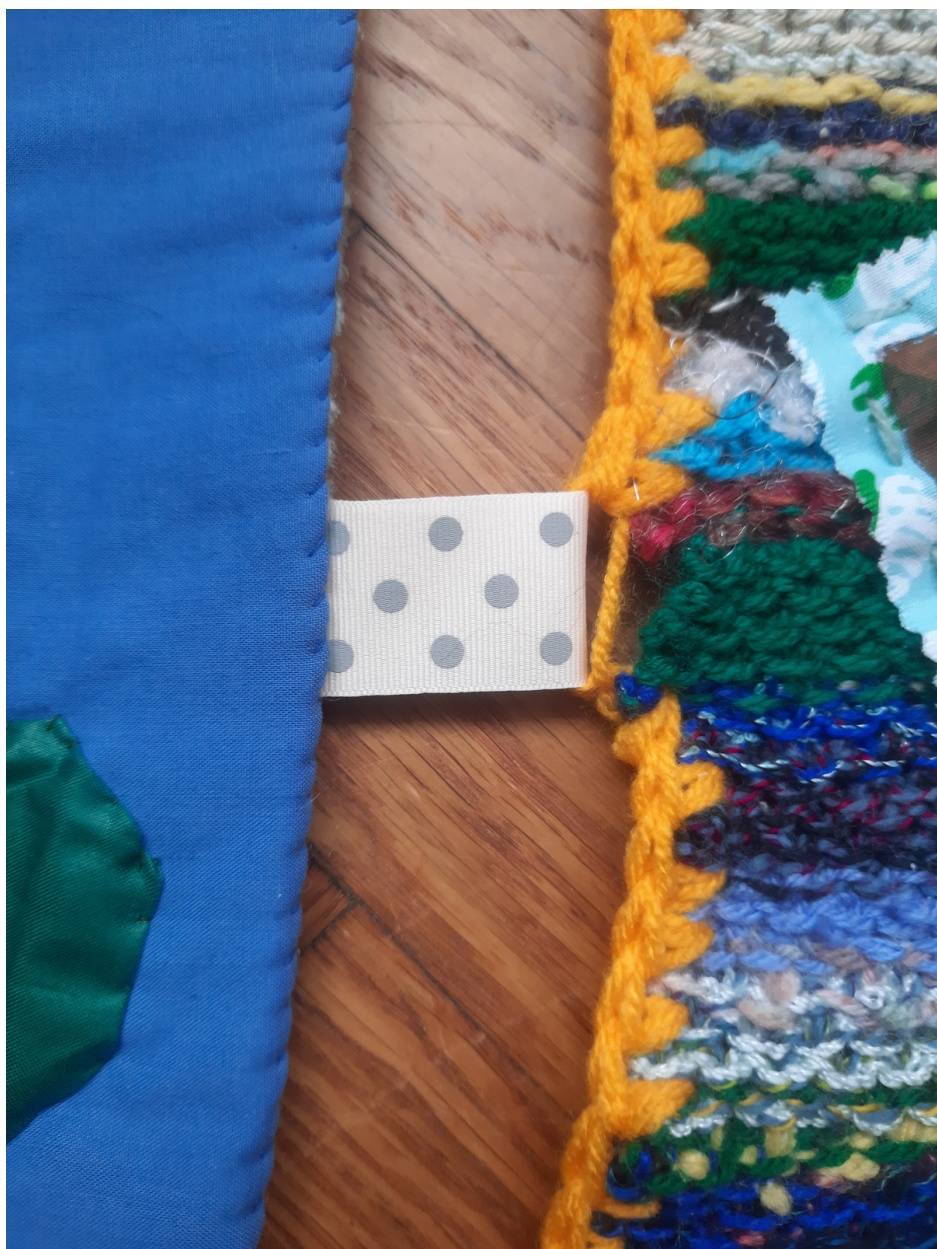
Fabric Loops (3)

https://www.facebook.com/groups/bristolstitchesforsurvival/permalink/760709381263779/