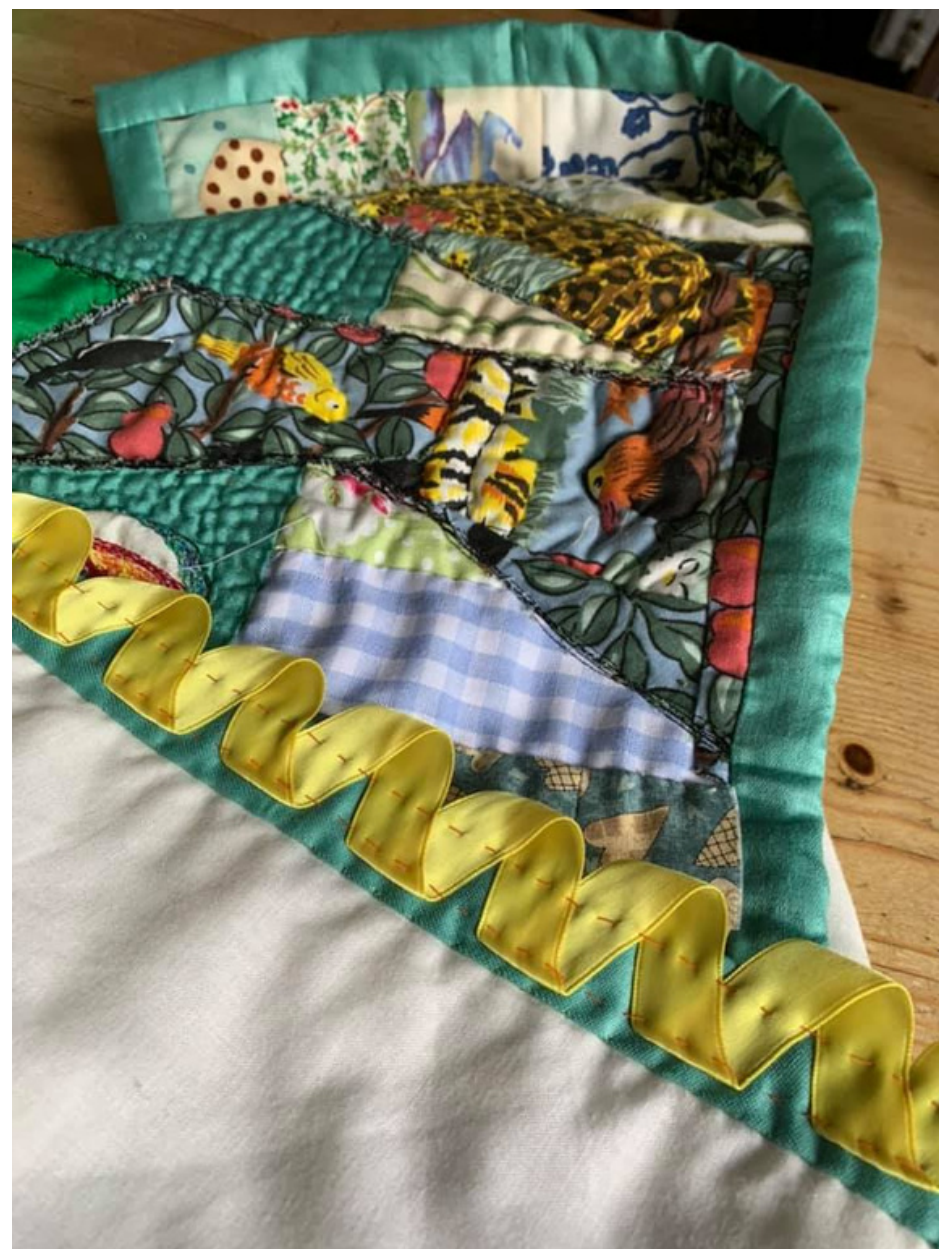
Continuous Ribbon (4)